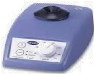
Stuart Vortex Mixer